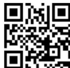
Apple Podcasts - Episode 1