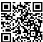
Spotify - Episode 1

The first few episodes are now live so if you haven't already make sure you go and check them out! Spotify, Apple Podcast or watch the podcast on Youtube. - Scan the QR codes below to listen now