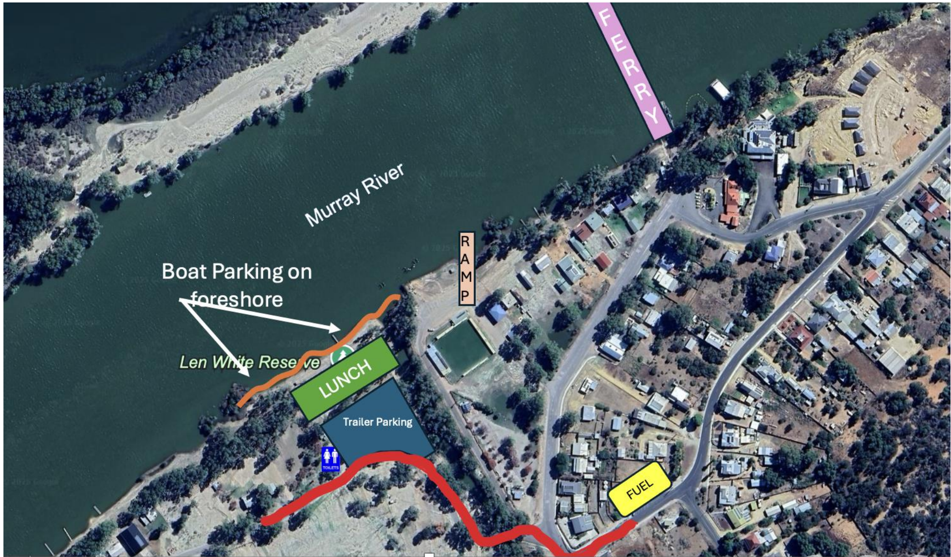
Friday Lunch – Swan Reach